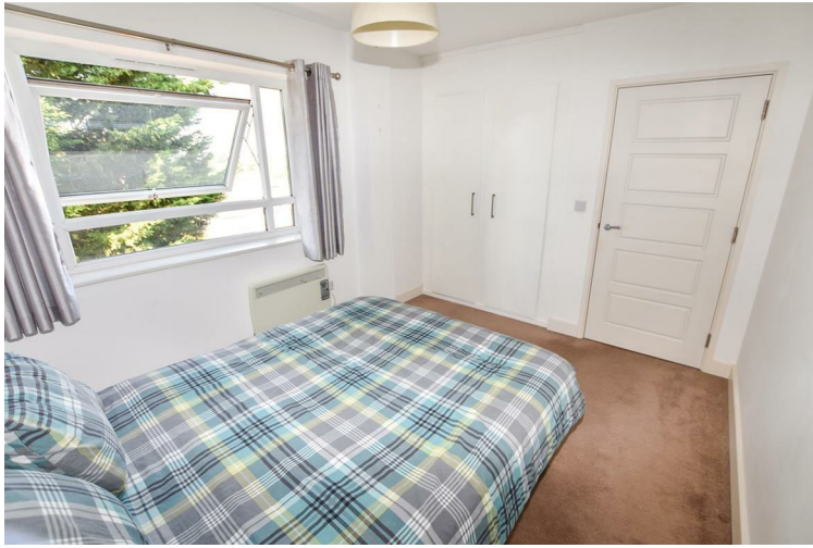
Bedroom Two 9'8 x 9'3 (2.95m x 2.82m)