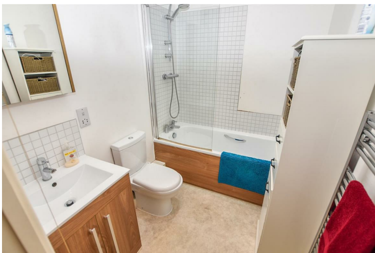
Bathroom 7'0 x 5'7 (2.13m x 1.70m)

Modern bathroom comprising of a panelled bath with shower over and glass screen, vanity unit with inset wash hand basin and chrome mixer tap, cupboards below, close coupled w.c., smooth plastered ceiling with inset spotlights, cushion flooring, chrome heated towel rail and electrical shaver point.